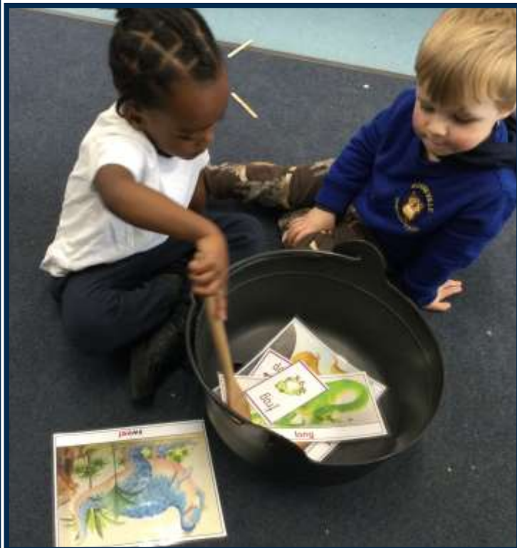
Phonic Soup, yummy!