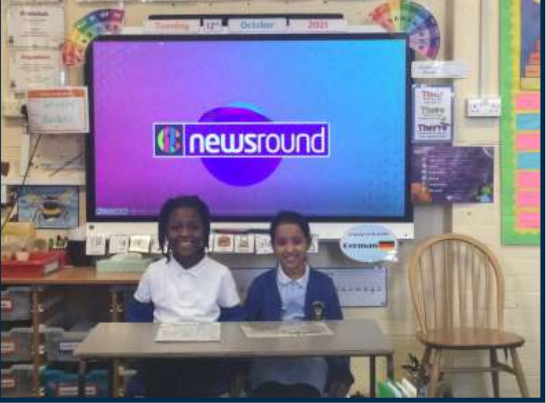
Year 4 Class Assembly Starts 9.15 am Prompt 4N Wednesday 1st December 4W Thursday 2nd December