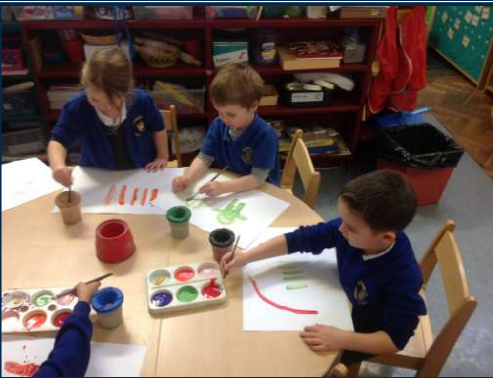
Nursery home learning

In Maths we have looked at 2D shapes and have been on hunts to find shapes around us, making sure we're using our key words of shape names and sides and corners. We are excellent shape hunters and found examples of circles, triangles, squares and rectangles!