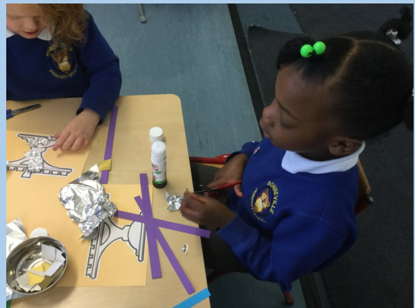
The children practiced their scissor cutting skills and created a menorah for their learning journeys.