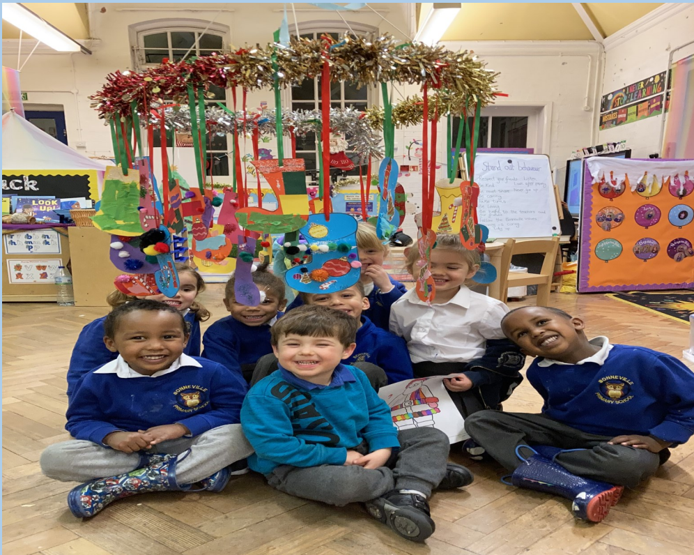
Afterschool club sitting under RC's Christmas hoop!