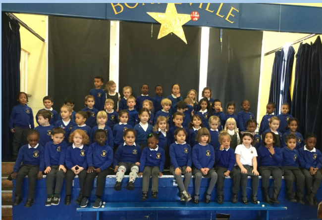
A sneak peak into the Christmas play!