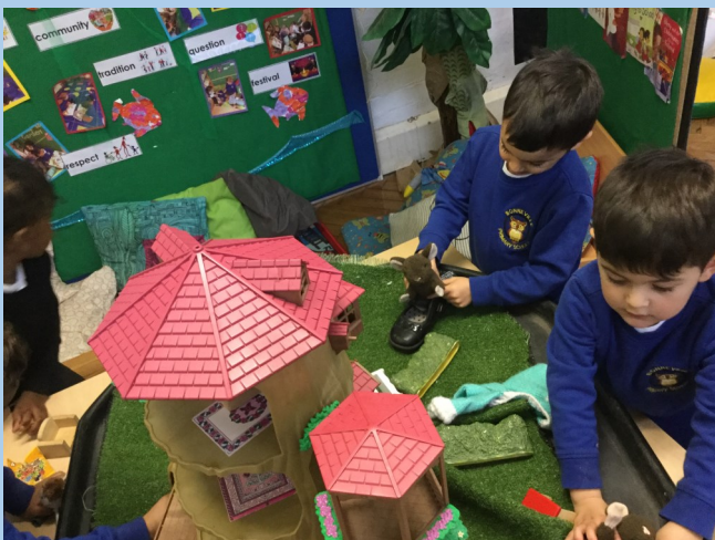
Reception have loved roleplaying The smartest giant in town.