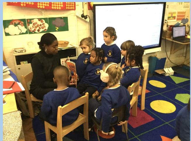
The children being read to.