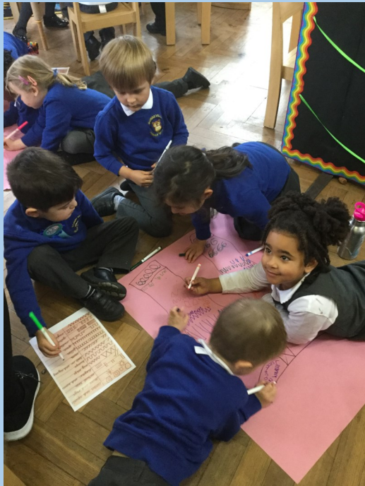
The RG children designing the Giant's new trousers.

As our story of the week is 'The smartest giant in town', RC & RG have been engaging with activities that have helped consolidate their learning.