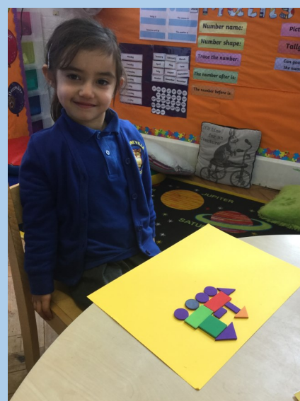
Scarlett created a picture of a train.

Thank you for your support Happy half-term!