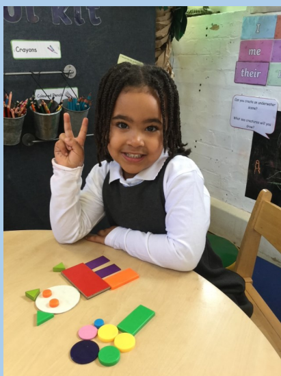
Arya created a picture of a flower and a cat.

This week, the RC & RG children created their very own shape pictures using 2D shapes. We saw a variety of pictures from cats to people to dogs to rockets!